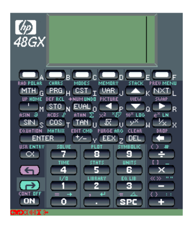
Figure 4: Recently posted HP48 image file for running Emu48 on Pocket PC handhelds.