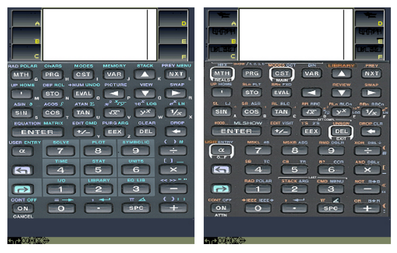
Figure 3a (left): HP48GX image file created from scanned image of actual HP48GX calculator keyboard. Figure 3b (right): HP48 image file created from scanned image of HP48GX with HP16C Emulator Library keyboard overlay installed.

The HP48/49 Emulator on the HP Jornada 540 Series Handhelds