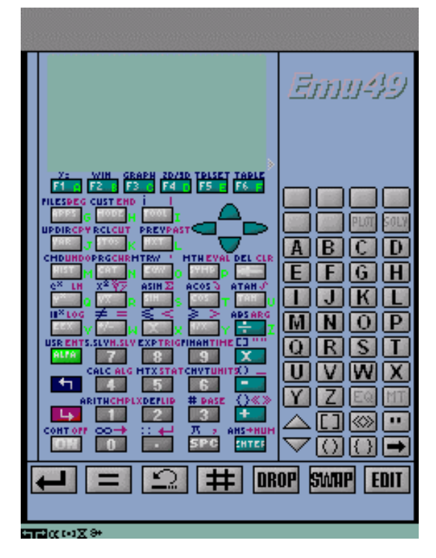
Figure 1a (left): Leo Castillo's Emu48 image file. Figure 1b (right): Leo's Emu49 image file.