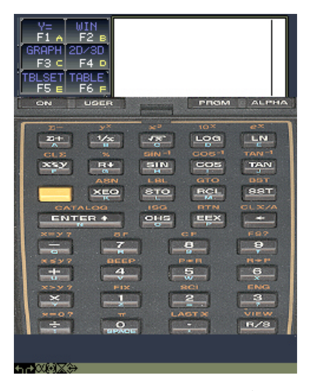
Figure 5: Image file created from scanned image of actual HP41CX calculator keyboard attached to HP49 display, to be used with HrastProgrammer's HP41 Emulator for the HP49.