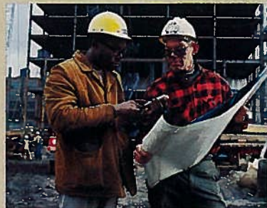
IN THE FIELD . . .

PROVE TO YOURSELF HOW THE HP-21 WILL HELP YOU SOLVE YOUR ACTUAL DAY-TO-DAY PROBLEMS MORE QUICKLY, ACCURATELY AND EASILY.