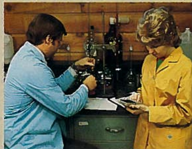
IN THE LABORATORY . . .